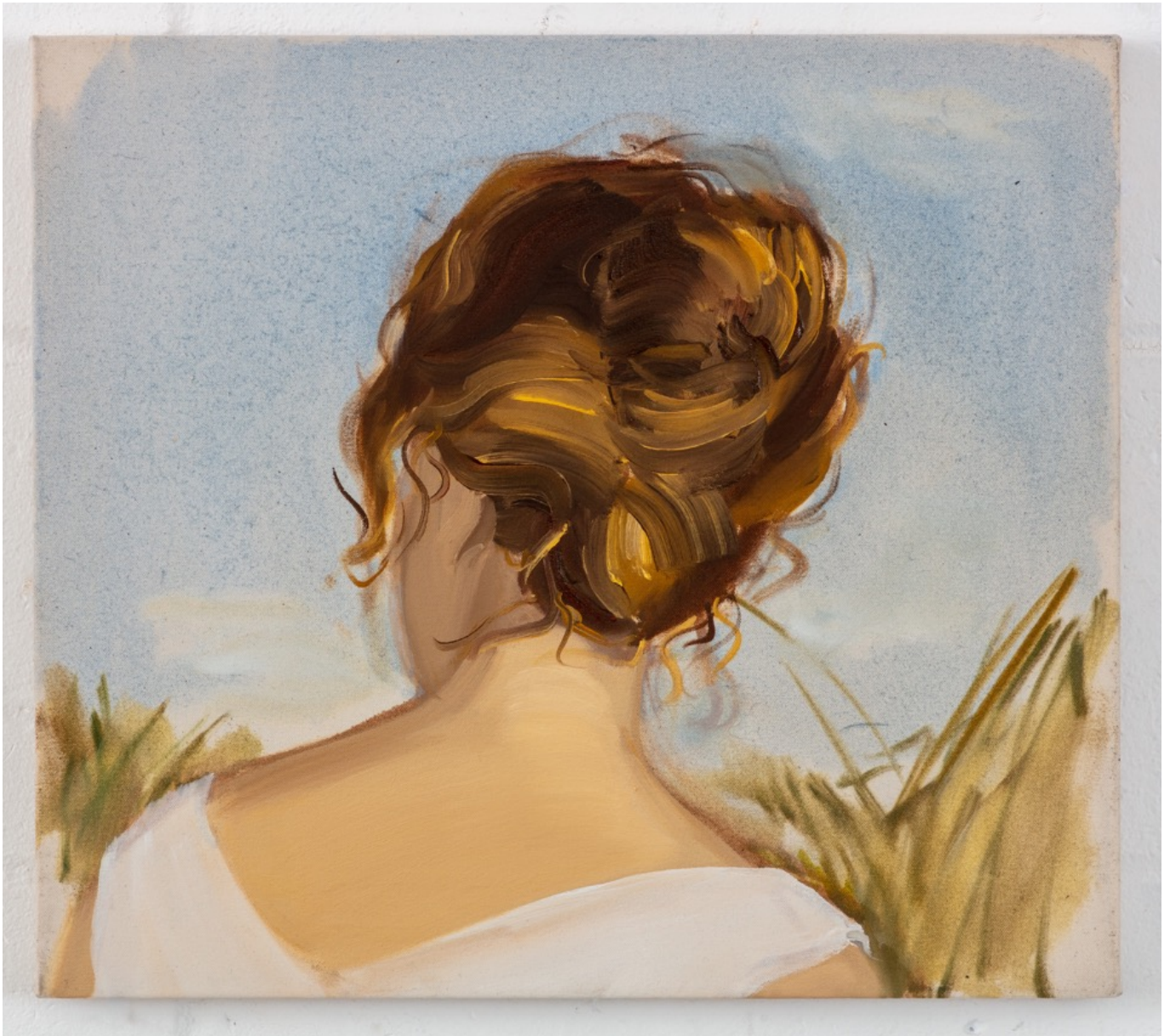
White Dress, 2023, Oil on canvas, 40.5 x 45.5cm ©Gideon Rubin / MAHO KUBOTA GALLERY

Maho Kubota Gallery is pleased to present The Last Day of Summer, a solo exhibition by Gideon Rubin, starting April 7, 2023. This is the artist's first solo exhibition in Japan and will feature eleven new paintings.