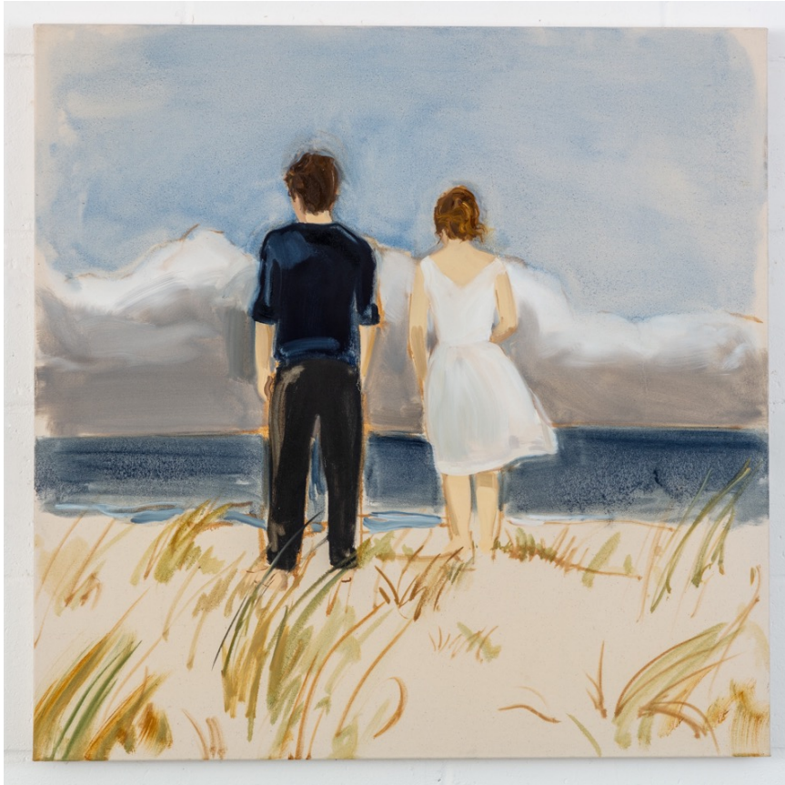
Couple on the Beach, 2023, Oil on canvas, 95 x 95cm ©Gideon Rubin / MAHO KUBOTA GALLERY