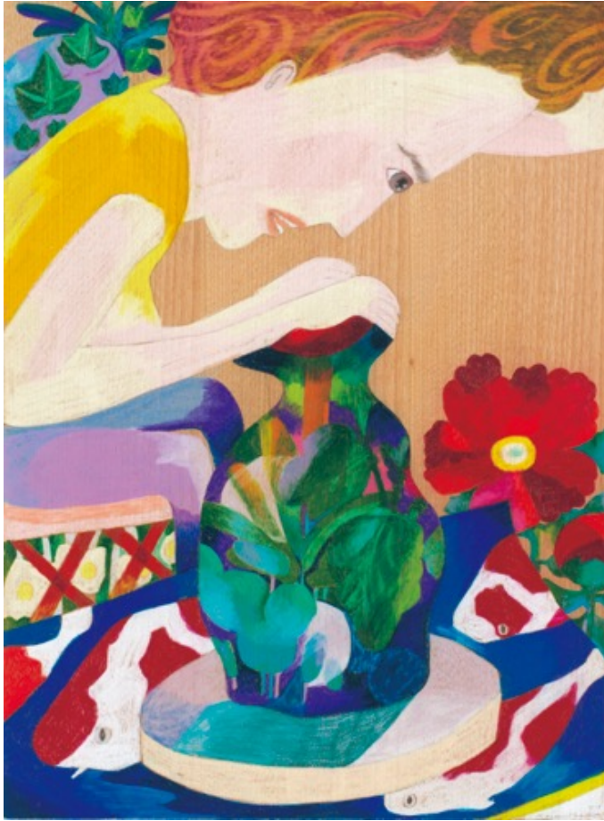
<The Potter Niigata> 2015