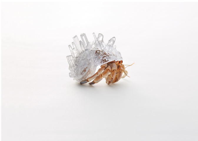
<Why Not Hand Over a "Shelter" to Hermit Crabs? -Tokyo-> 2016