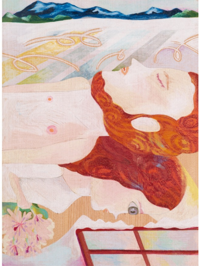
top left <Why Not Hand Over a "Shelter" to Hermit Crabs? -Tokyo-> 2016 bottom left <Halfpipe Park> 2016 right <Memory Niigata> 2015